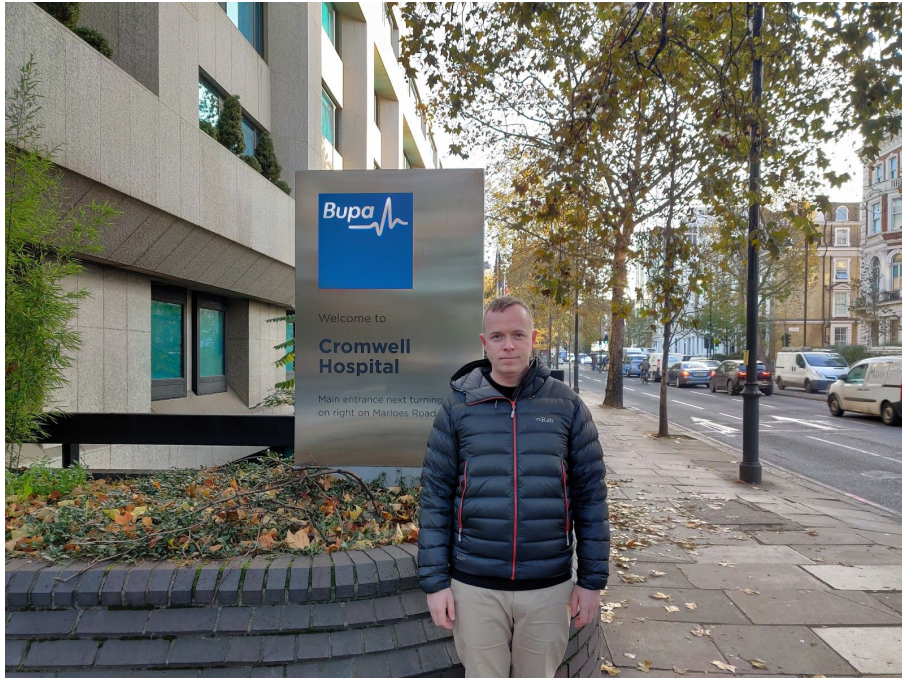
D-Day - Outside The Cromwell Hospital, London

The 12th November arrived like a sudden but forecast storm. I'd reached and watched some YouTube videos featuring the robot. It was difficult to tell the difference between Da Vinci promotional videos and HG Wells, War of the Worlds.