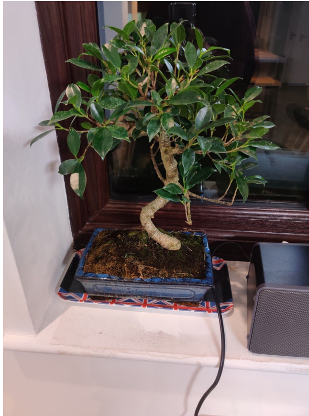
Bonaparte my beloved Bonsai - 46 years old