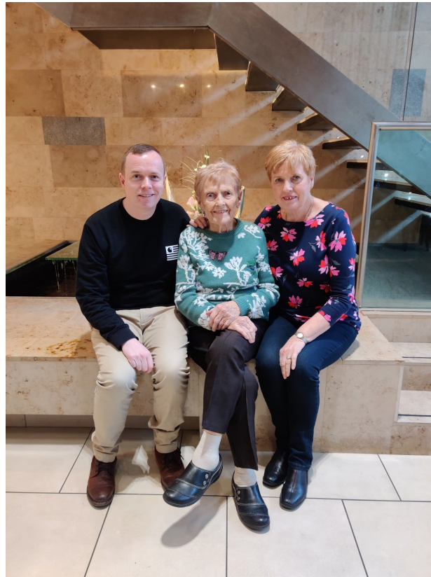
My granny is going strong at 94 years old. With my mum

2020 will be the year I return to skiing, enjoy two weddings, visit my 94 year grandmother in Ireland, celebrate a holiday in gran Canaria with friends, visit St Petersburg, walk over the chain bridge in Budapest, discover the modernist architecture of Le Havre, finish my reading list, improve my French, reconnect with the Welsh language, embrace Yoga and Chinese medicine and of course return to work.