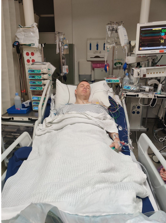
Intensive experience in intensive care

Waking up in intensive care was a surreal experience.